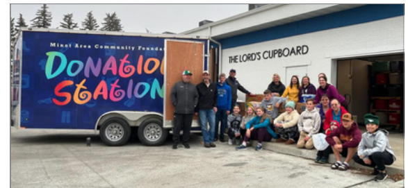
Over 15,000 pounds were collected and $11,500 was granted to local food pantries during the fall donation station challenge grant.