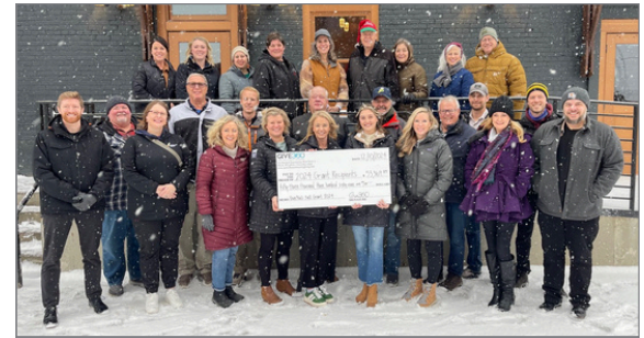
Give360 granted over $53,000 into the community during the 2024 fall grant meeting.