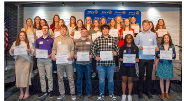
Scholarship funds facilitated by MACF awarded over $47,000 to area high school seniors in 2024, and over $970,000 since inception.