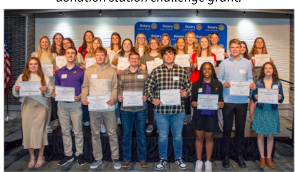
Scholarship funds facilitated by MACF awarded over $47,000 to area high school seniors in 2024, and over $970,000 since inception.