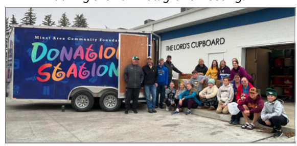
Over 15,000 pounds were collected and $11,500 was granted to local food pantries during the fall donation station challenge grant.