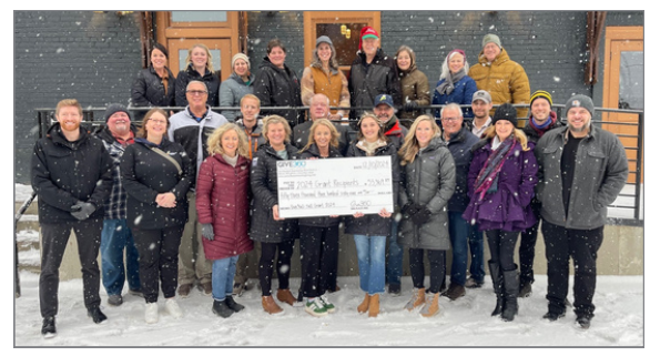
Give 360 granted over $53,000 into the community during the 2024 fall grant meeting.